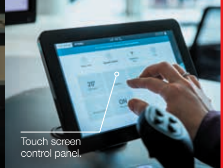
Touch screen control panel.

The Kalmar Remote Console gives you the ability to operate many types of equipment remotely, from just about anywhere.