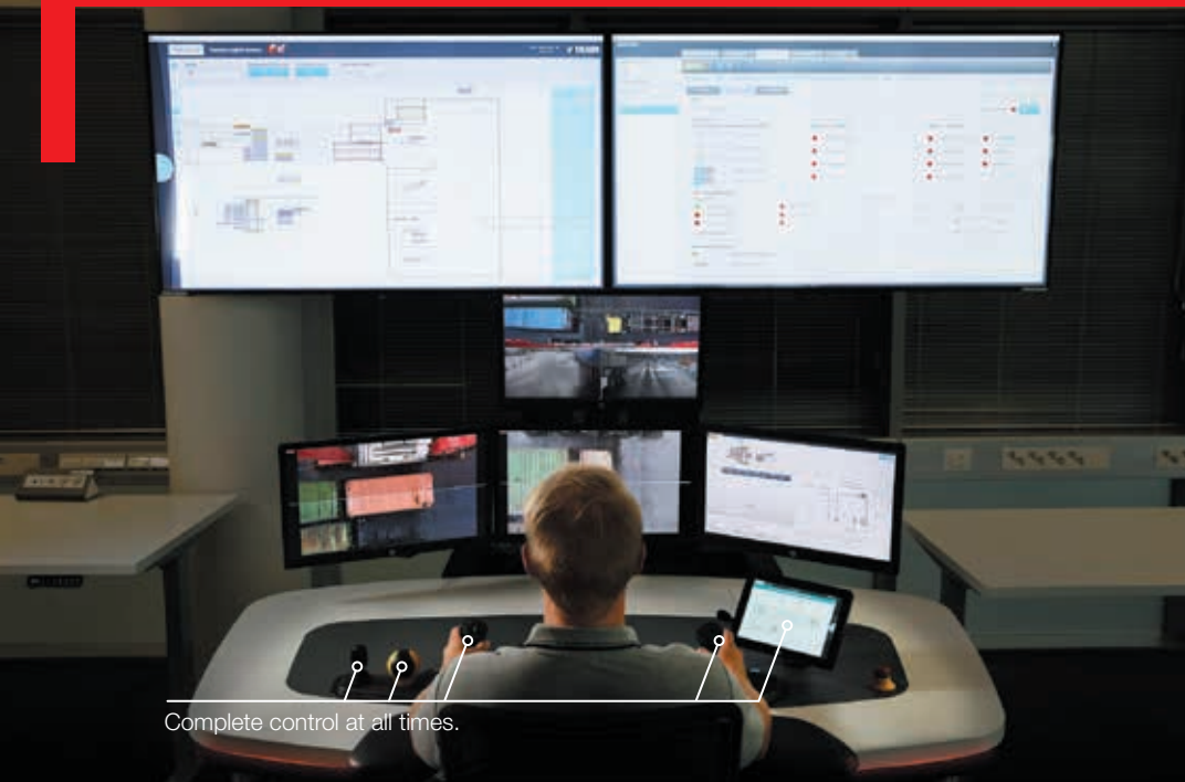
Complete control at all times.